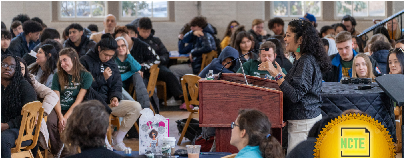
Author Aimee Nezhukumatathil speaks at ASR 2024.